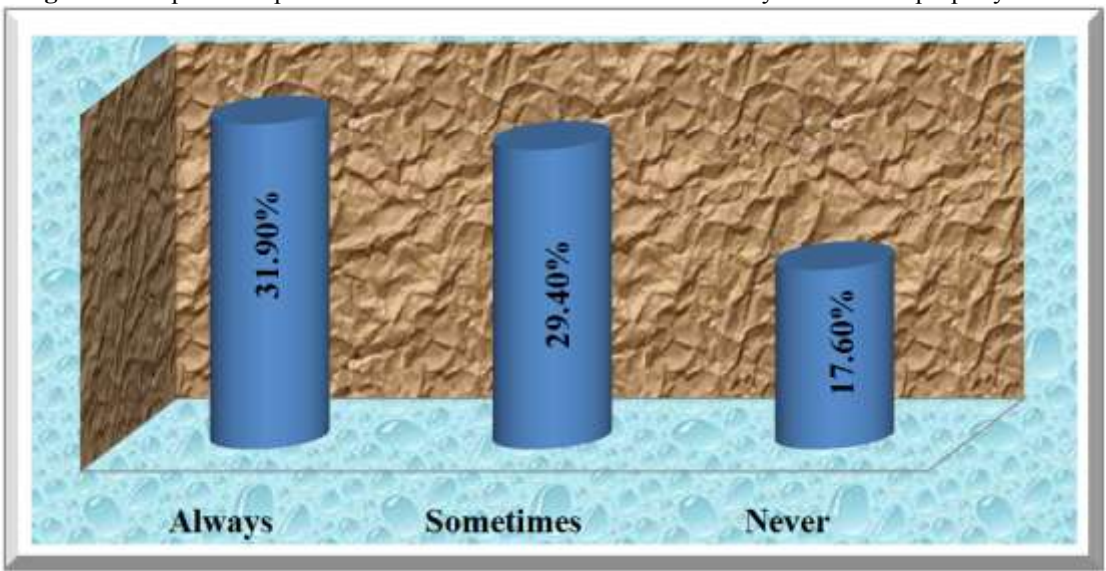
Figure 2: Respondents perceived involvement of commercial motorcycle riders' in property crimes

Figure 1 above shows that 43% of the respondents were of the opinion that the use of commercial motorcycles in the commission of property crimes often occurs at any period of the day, 35% of the respondents were of the view that the use of commercial motorcycles in the commission of property crimes often occurs in the daytime, 16% of the respondents were of the opinion that the use of commercial motorcycles in the commission of property crimes often occurs when the passengers create room for that while 6% of the respondents were not certain about the period of the day which the use of commercial motorcycles in the commission of property crimes often occurs.